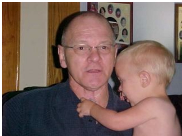
If I push this, he talks!